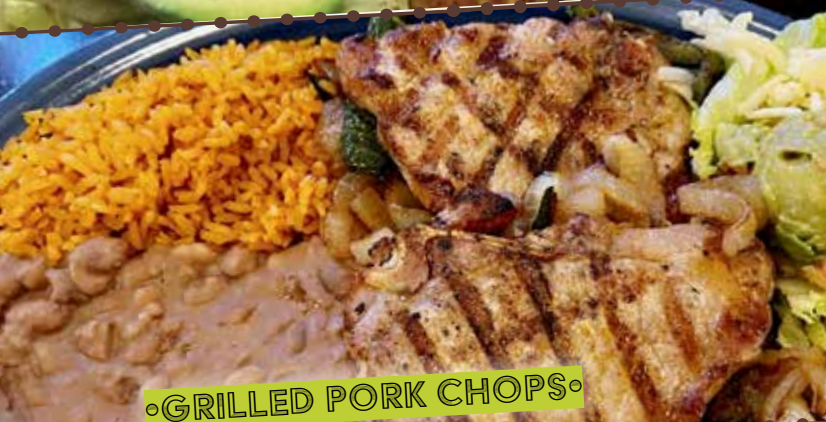
◦GRILLED PORK CHOPS◦