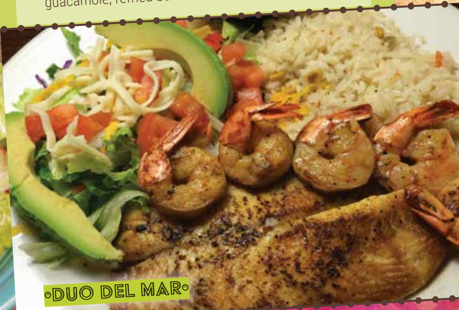
◦DUO DEL MAR◦

Chicken breast strips sautéed Mexican-style with peppers, tomatoes and onions. Served with guacamole, refried beans and rice - 18.95