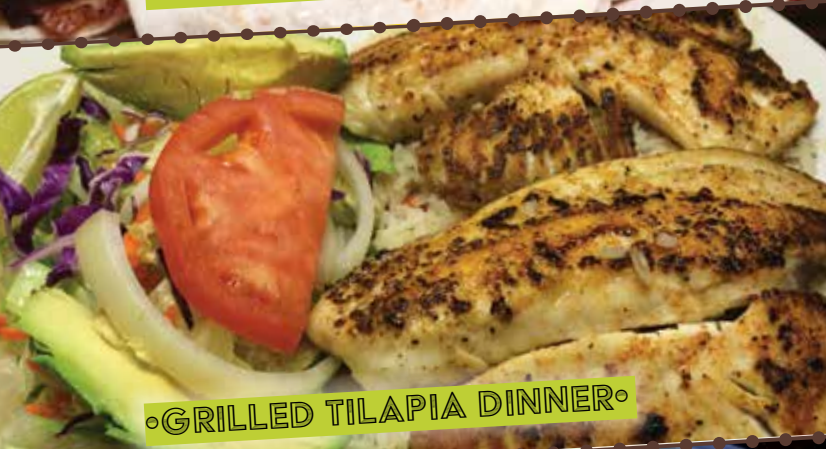
◦GRILLED TILAPIA DINNER◦