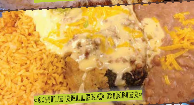
◦CHILE RELLENO DINNER◦