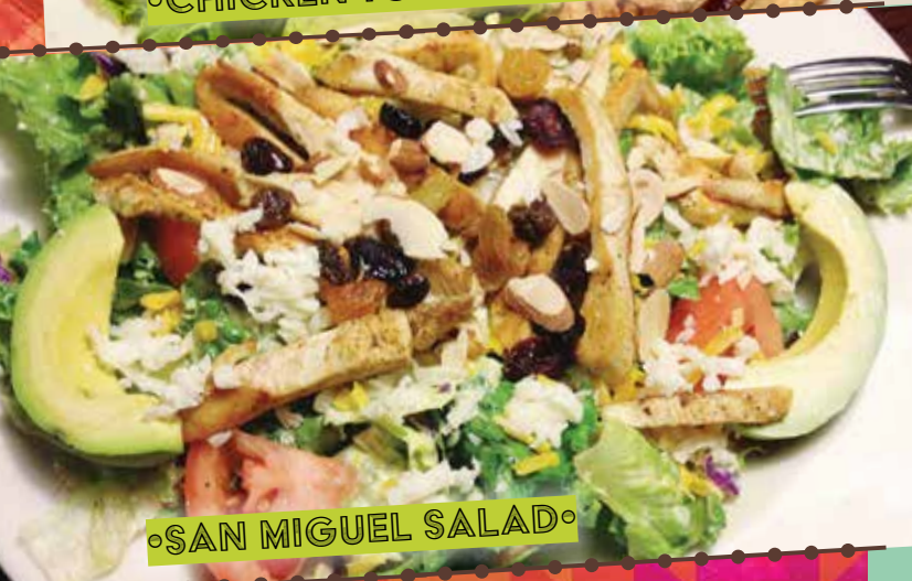
◦SAN MIGUEL SALAD◦

Try our delicious combination of green lettuce, shredded carrots, tomatoes, onions, sliced grilled chicken fajita, toasted caramelized almonds, golden raisins and sliced avocado. Served with honey mustard. A sweet combination! - 15.95