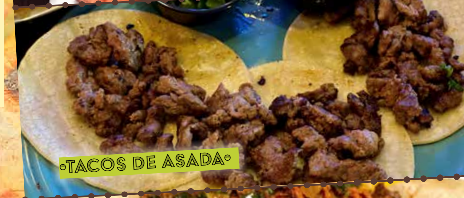
◦TACOS DE ASADA◦