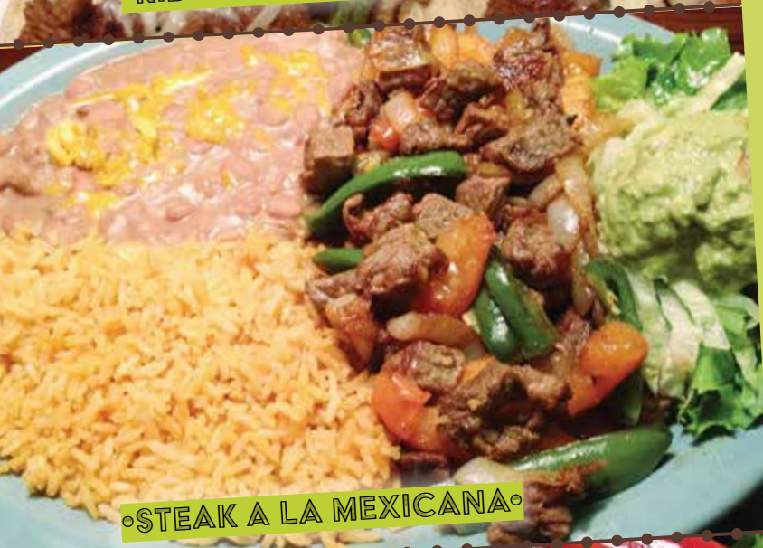
◦STEAK A LA MEXICANA◦