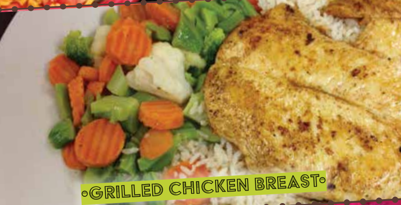
◦GRILLED CHICKEN BREAST◦