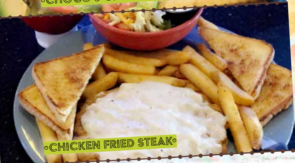
◦CHICKEN FRIED STEAK◦