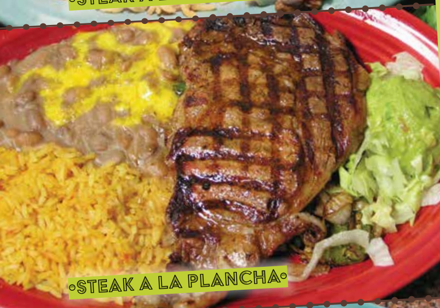
◦STEAK A LA PLANCHA◦