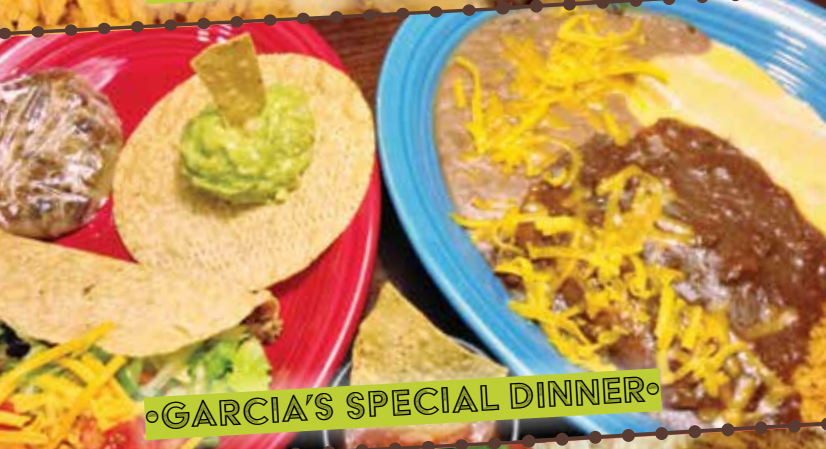
◦GARCIA'S SPECIAL DINNER◦