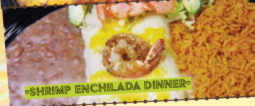
◦SHRIMP ENCHILADA DINNER◦