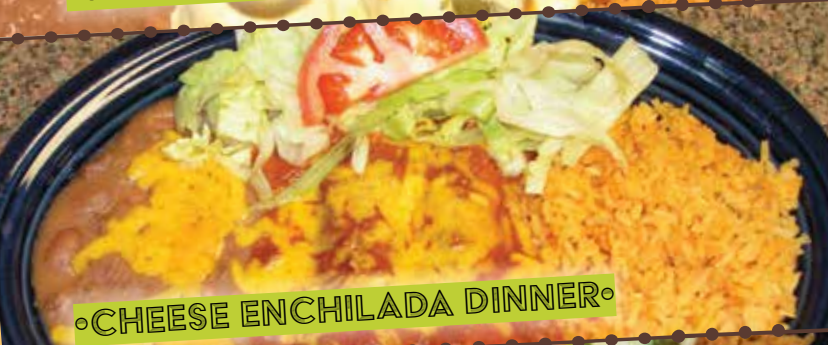
◦CHEESE ENCHILADA DINNER◦