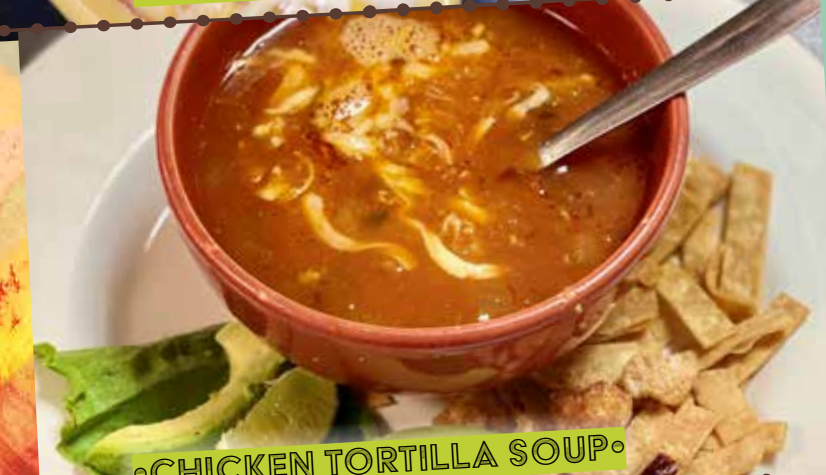
◦CHICKEN TORTILLA SOUP◦

Fresh avocados blended with ripe tomatoes and seasoned with our own special spices. Served on a bed of lettuce. Small - 5.25 Large - 8.25